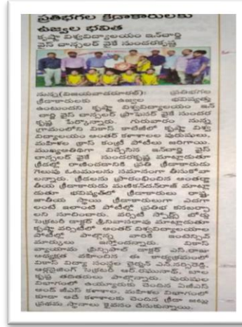
Our college Students selected for Krishna University All India Inter University Cross Country (Men) Team